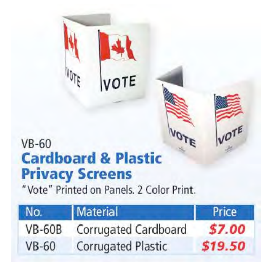
EXHIBIT 6: TABLETOP FOLDING PRIVACY SCREENS

storing election equipment . Many voting booths are commercially available for far less than the $360 quoted by ES&S, including used equipment. Other jurisdictions use a wide range of voting booths, including folding cardboard or corrugated plastic privacy screens placed on a tabletop such as those Maryland currently uses for provisional voters in the polling place. Many voters prefer to sit while they vote and are more likely to mark their ballots thoughtfully and review them carefully than voters who feel rushed. Tables and chairs are currently used for check-in and other polling-place tasks , so most polling places, such as school cafeterias, public libraries, community centers, firehouses, and churches, have them readily available. They may be easily rented for polling places that do not have enough.