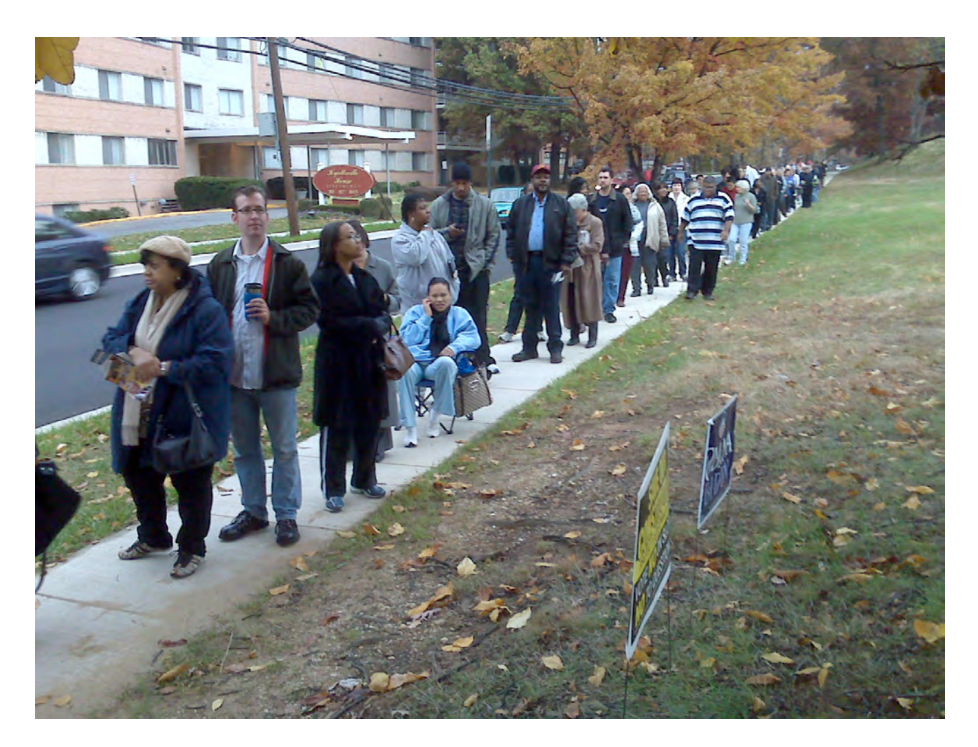
EXHIBIT 7: TAIL END OF VOTING LINE IN PRINCE GEORGE'S COUNTY, NOVEMBER 2008

No matter which type of voting booths is selected, <u>each precinct should provide plenty of ballot-marking</u> <u>spaces to prevent long lines at peak voting hours</u>. The number of voting booths the SBE has proposed is insufficient. Each precinct should have at least as many booths as the number of touch-screen machines previously supplied, and preferably far more. One of the greatest problems created by the touch-screen voting system has been long lines, with wait times of two hours or more documented across the state during the 2008 General Election. At the very least, additional folding privacy screens should be provided that could be set up at peak voting hours if lines begin to form.